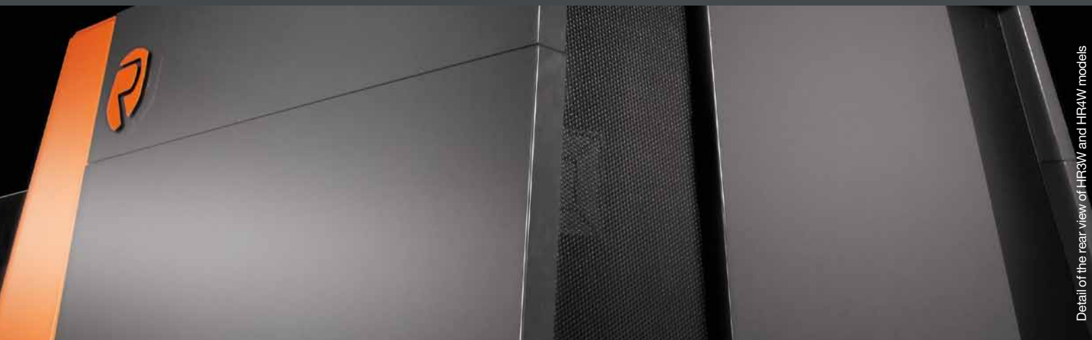
Detail of the rear view of HR3W and HR4W models

The ROCCIA plate rolls modern design lines subtly communicate that here is a high tech plate rolling machine that will deliver exactly what its specification states: a high tech specification , proven and reliable components, robustness of construction, ease of use, value for your money. From first sight the ROCCIA plate roll stands out from all other plate rolling machines, it is the outcome of a precision design, graphical analysis and 3D modeling, plus that all important ingredient, hands on plate rolling knowledge accumulated over many years.